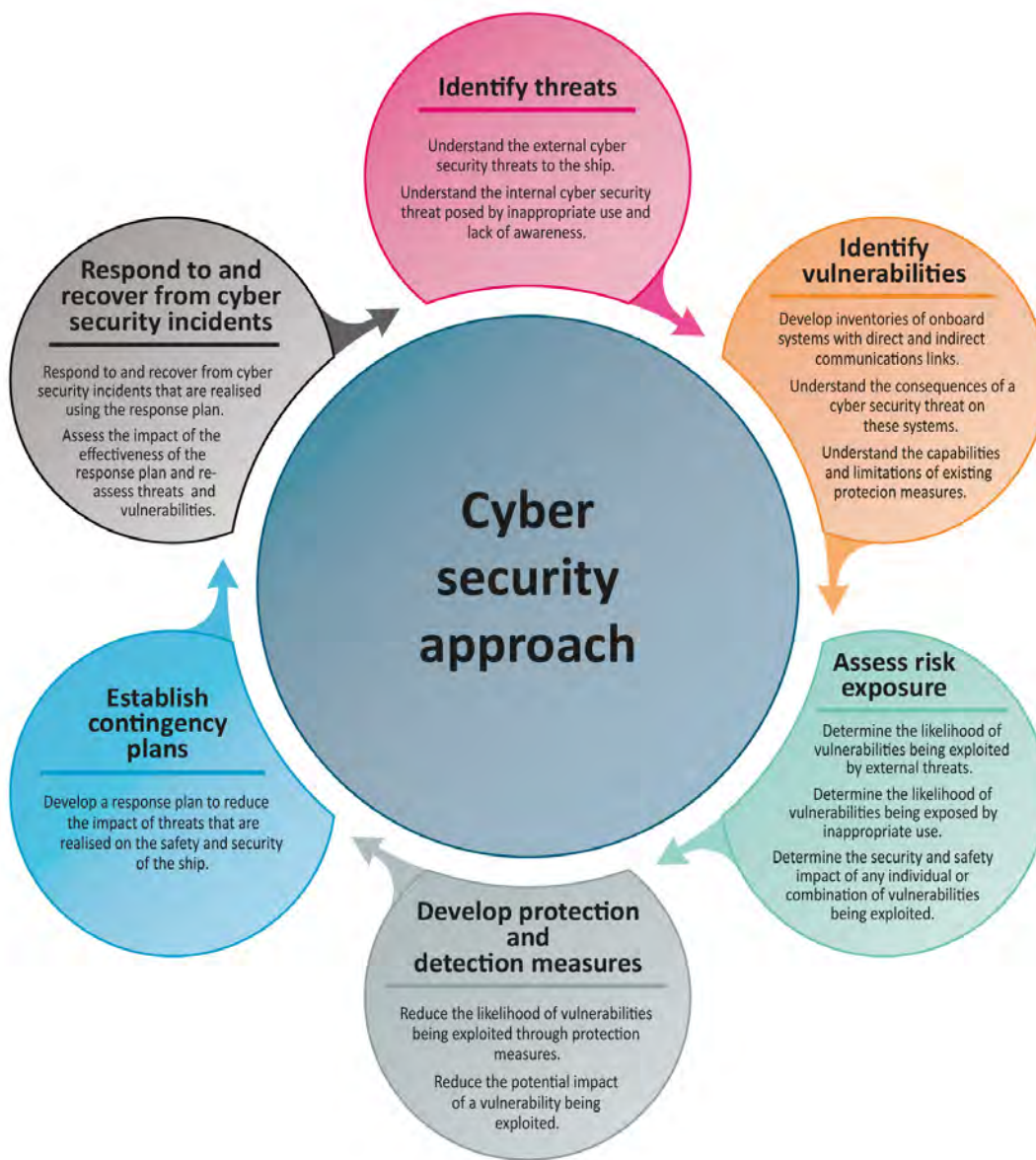
Figure 1. Cyber security approach as set out in the guidelines